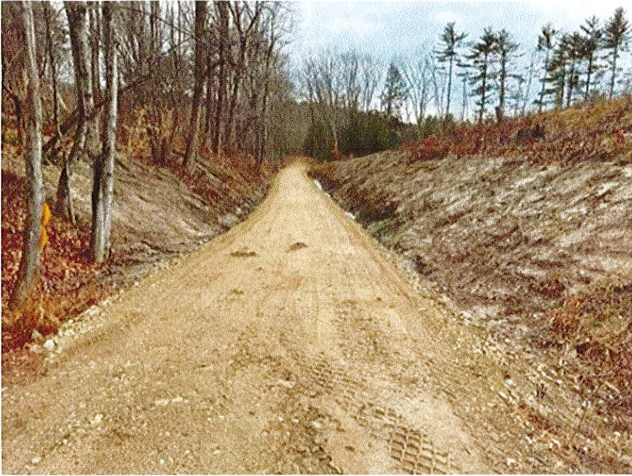
Trail heading north from Tannery