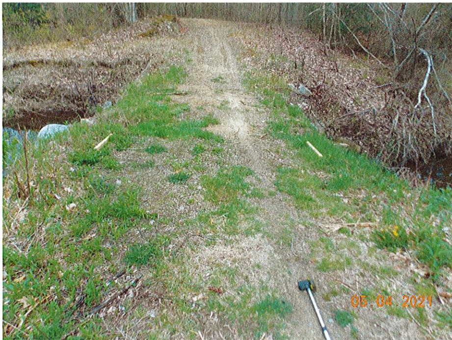
Trail stability, widening and surface improvements off Old Westport Rd.