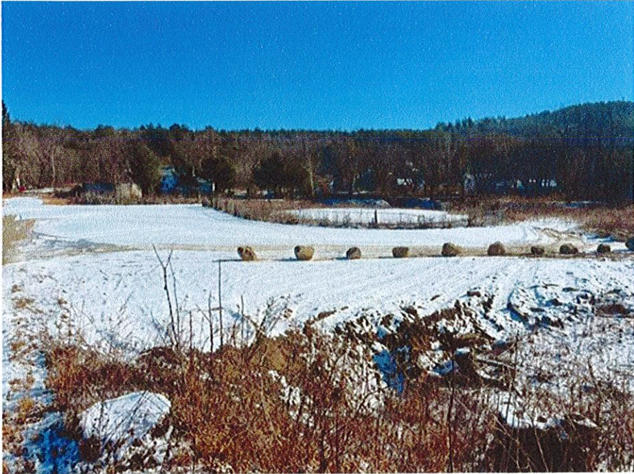
Parking area at the Tannery for all seasons