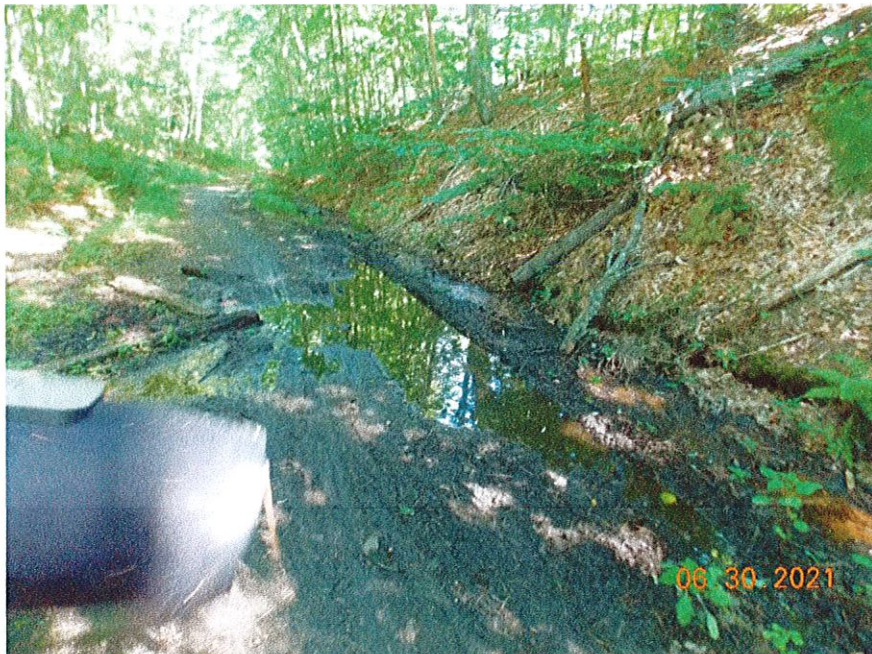
Off Back Ashuelot Road drainage