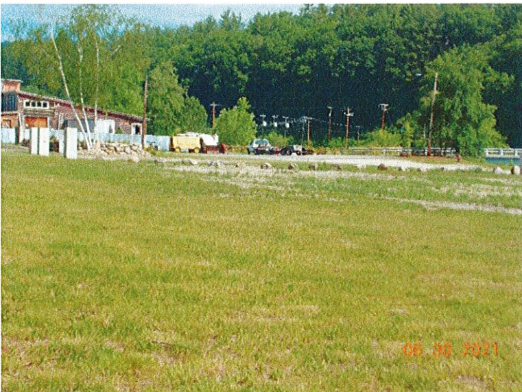
Parking off Recycle way done by owner June 2021