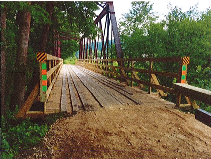
North bridge repairs finished spring of 2021