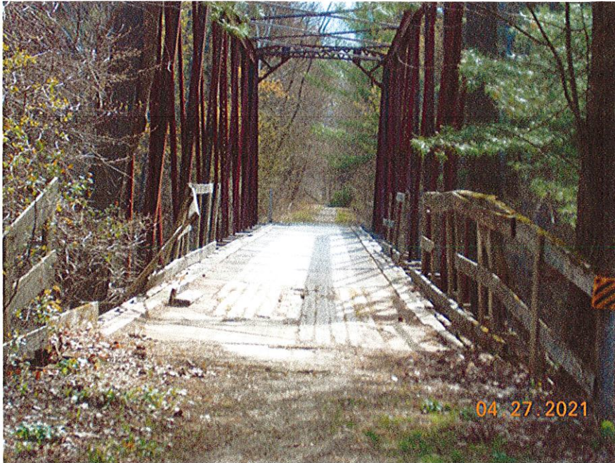
South Bridge work – deck and railings